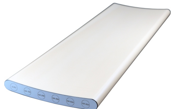
Different versions in length of QRM-BDC (200, 300 and 700 mm)