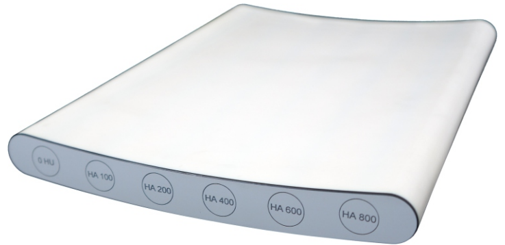
QRM-BDC Phantom 200 mm length