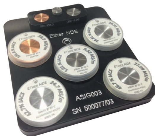
Conductivity Test Blocks In Holder

ETher NDE also manufacture individual conductivity test blocks which may be used to match the clients own testing requirements. We can also provide a handy test block holder (Part number: ASIG003) that can hold up to five of these test blocks at any one time as shown above.