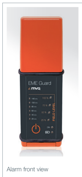
Alarm front view