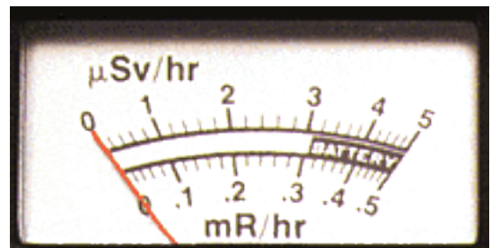
Optional SI Meter Scale: 0-500 µSv/hr & 0-50 mR/hr