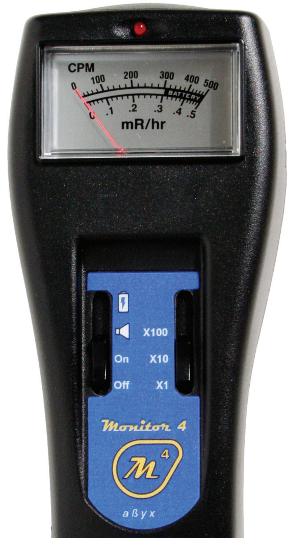
M4 with CPM & mR/hr meter scale

Analog Meter holds full scale in fields as high as 100X maximum reading. CPM & mR/hr scale. Optional SI Scale Meter Available