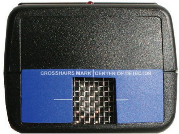
The end window of the M4 and M4EC

Dual miniature jack drives CMOS or TTL devices: count to computer or datalogger. Submini jack input allows for electronic calibration. USB versions of the M4 and M4EC have a mini-USB jack for use with the USB Observer Software.