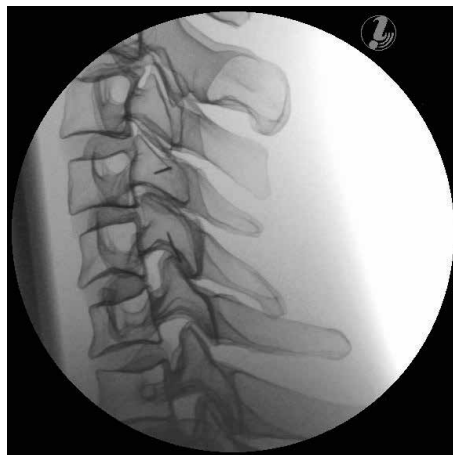
Medial branch block C4-C5

Images taken with an X-ray machine combined with an image converter.