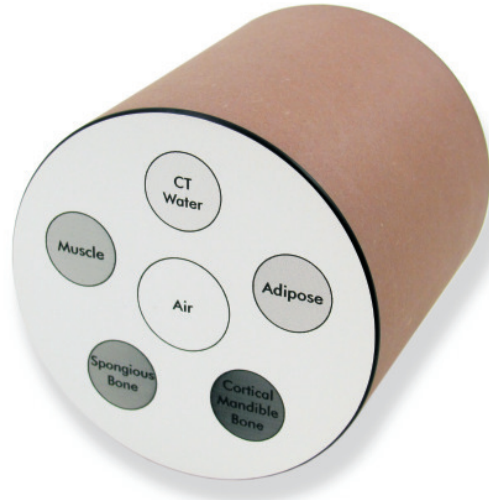
Electron Density Phantom (QRM-EDP)

Yohannes I, Kolditz D, Langner O, Kalender WA; A formulation of tissue- and water-equivalent materials using the stoichiometric analysis method for CT-number calibration in radiotherapy treatment planning; Phys. Med. Biol. 57 (2012) 1173-1190.