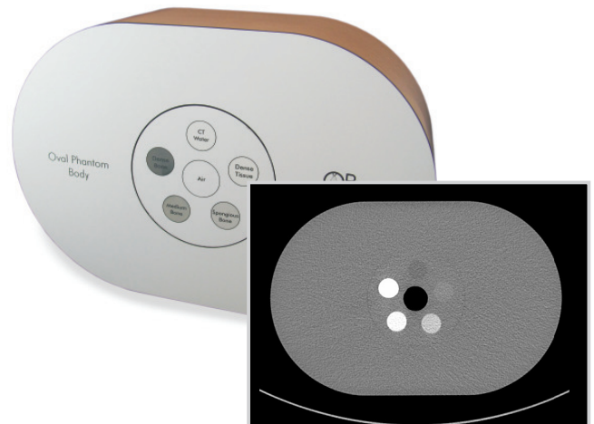
QRM EDP placed in optional available water equivalent Oval Phantom Body