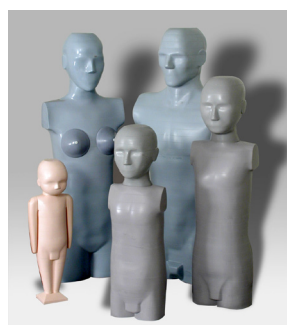
ATOM Models 701-706