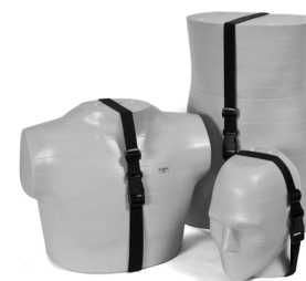
ATOM Head & Neck, Thorax & Pelvis Sections