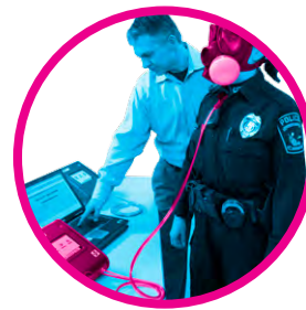
Industry Best Testing Method