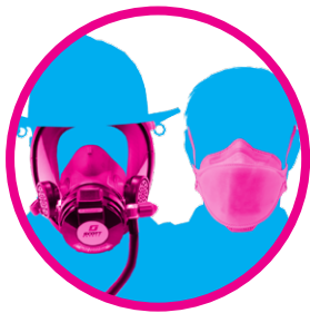
Quantitatively Fit Test Any Respirator Type

MORE THAN A PIECE OF EQUIPMENT, IT IS PEACE OF MIND